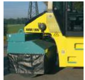
Pneu tyred rear axle