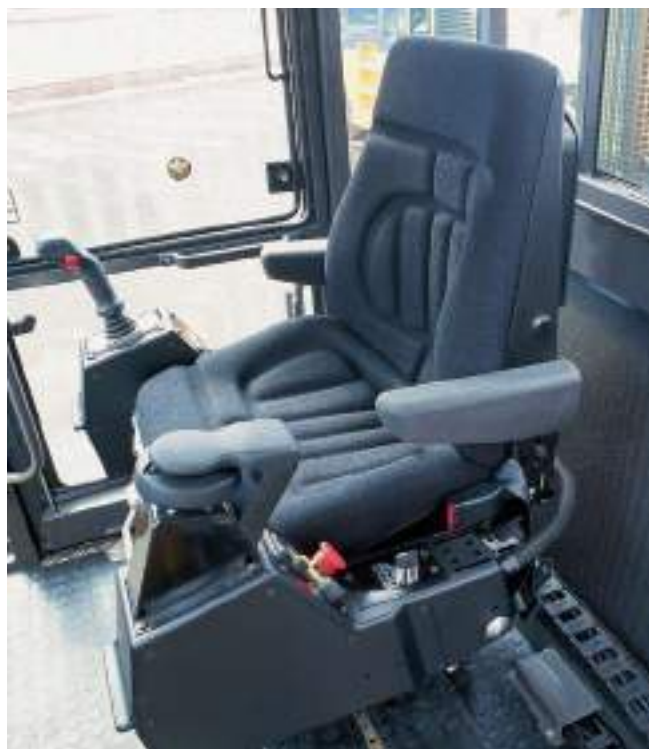
Sliding & rotating seat with integrated control instruments

Combi rollers AV 70-2 K, AV 85-2 K and AV 95-2 K join benefits of vibratory and rubber tyred rollers. The front vibratory drum enables the machine to achieve high level of compaction, while the rear rubber tyred axle homogenizes a compacted surface.